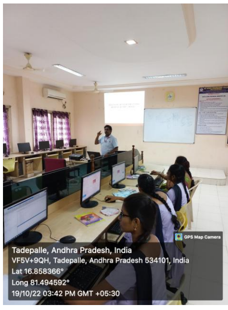
Fig-6: Deep learning algorithms hands-on session