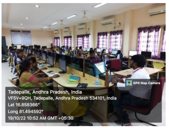
Fig-5: MATLAB Hands-on session

In this hands-on session, the speakers delivered how to write MATLAB coding for image processing applications such as reading an image, display an image, applying preprocessing techniques like channel separation, enhancement, filtering techniques.